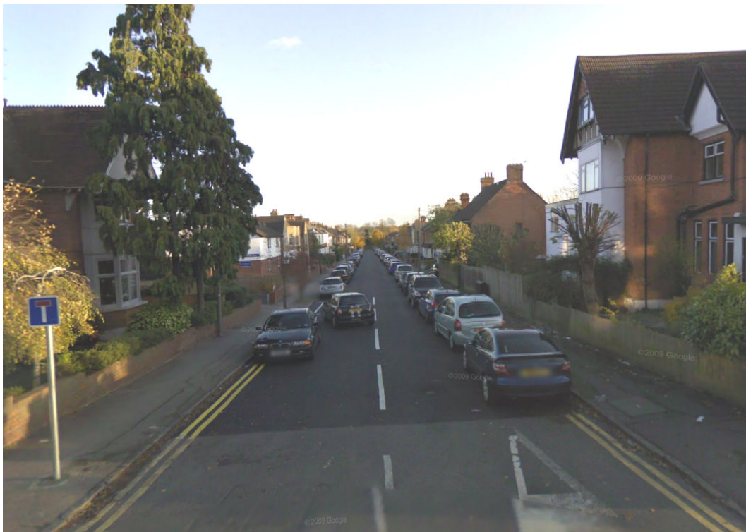
Figure 2 View from High Road