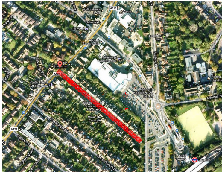
Figure 1 Plan