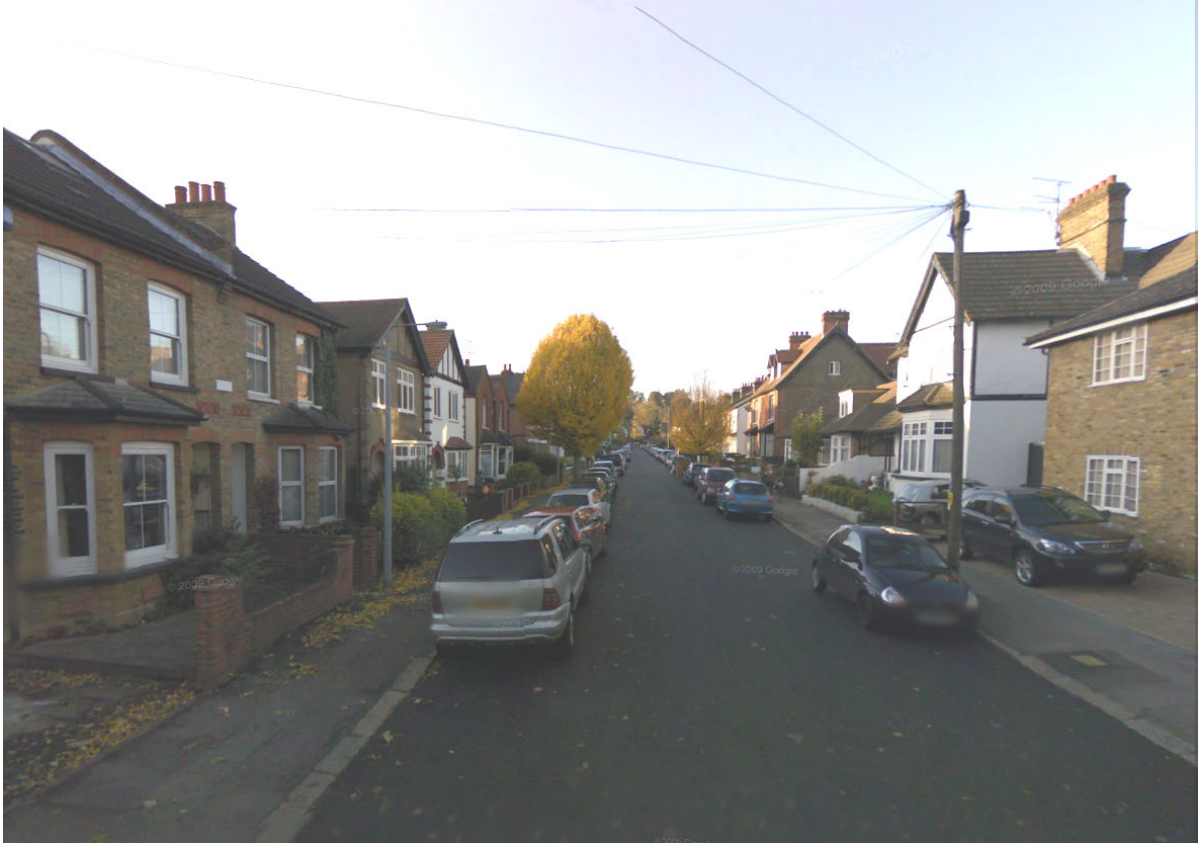
Figure 3 View from Meadow Road